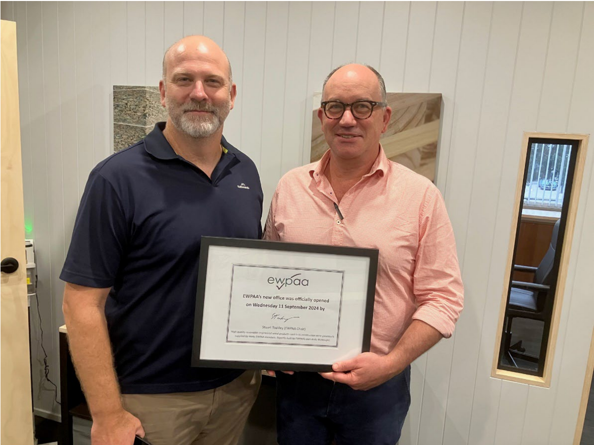
EWPAAs new mezzanine office