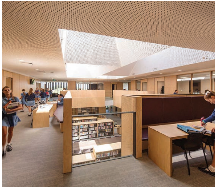
The award-winning Mandeville Centre is a focal point for the school community, in function and location, acting as a link to all school operations. Plywood panelling and joinery feature throughout the school.

The architecture draws on the library building typology in terms of promoting the quality of light and space.