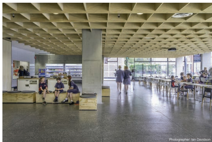
More than 400 sq m of plywood was used in the baffle ceiling above the cafeteria at The Gipson Commons.

storey complex, a high level of natural and artificial lighting, and external connection through views that preserve sweeping vistas