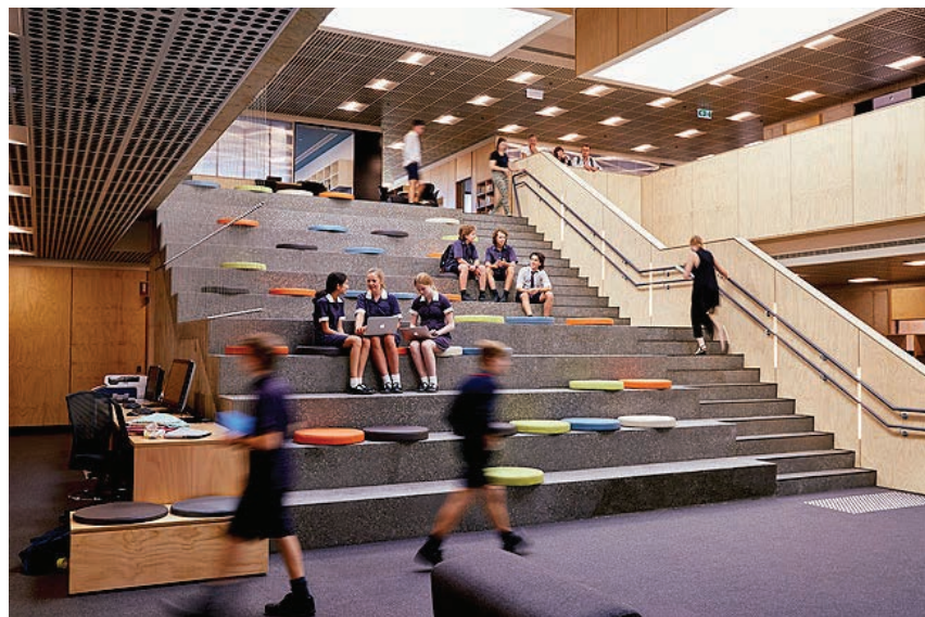
Plywoods provide a wonderful environment for student learning at St Michael's Grammar School.

The Gipson Commons project used more than 1000 sq m of plywood for wall lining and more