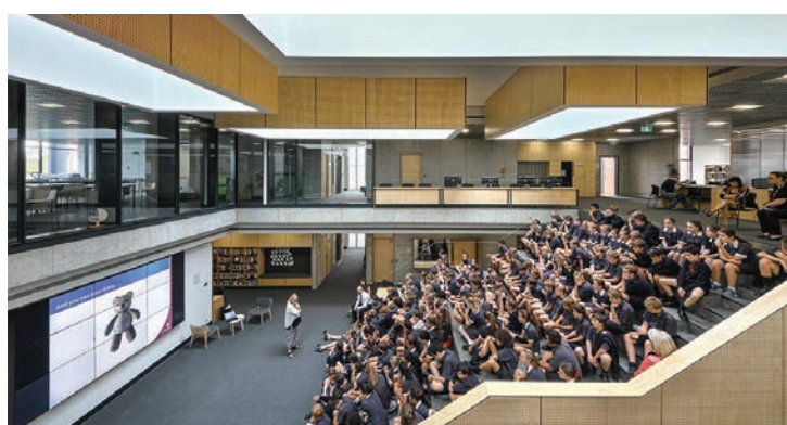
EWPAА Wood Panels Award winner ... the Gipson Commons at St Michael's Grammar School in Melbourne.